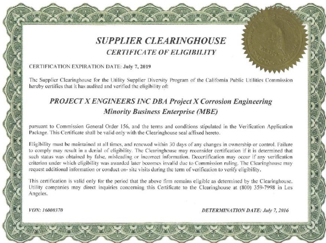
Figure 2- Supplier Clearinghouse MBE VON 16000370